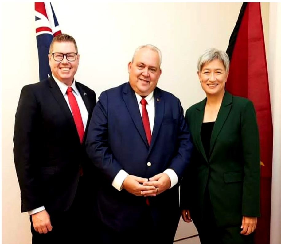
Minister Tkatchenko with the Australian Cabinet Ministers Hon. Pat Conroy and Senator Penny Wong

Minister Tkatchenko also took the opportunity to reassure both Senator Wong and Minister Conroy of the PNG Government's commitment to its traditional security partners in working with them to securing the peace and stability of the region, hence, dispelling the misinformation that PNG is entering into a security cooperation with the People's