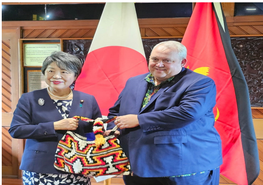
Minister Tkatchenko presenting gift (bilum) to Foreign Minister of Japan Yoko Kamikawa

He commended Japan not only as a valuable bilateral partner but also an integral development